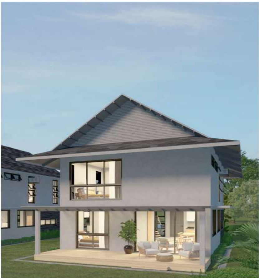
2 SD-08 3 BEDROOM VILLA REAR PERSPECTIVE SCALE NTS

DISCLAIMER: The developer will exert its best effort to conform to the specifications and plans specified herein. However, the developer reserves the right, without prior notice, to alter and change the specifications and plan as may deemed to maintain the feasibility of the project.