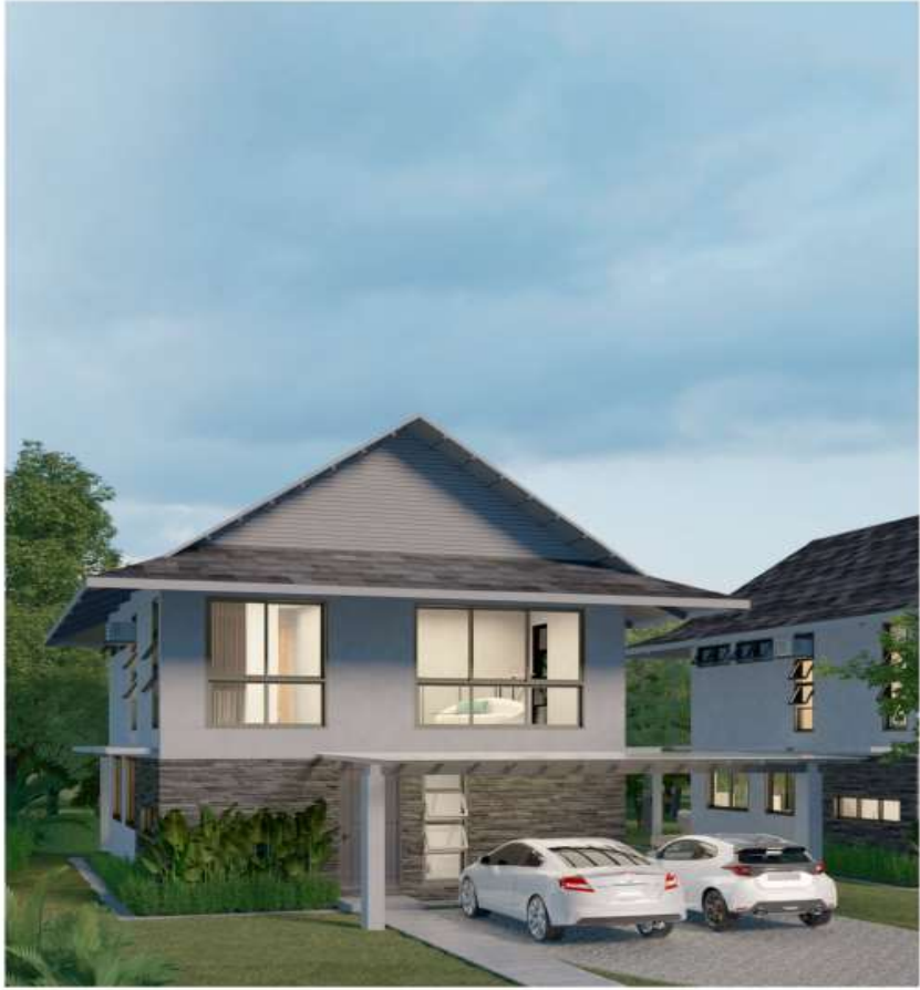
1 SD-08 3 BEDROOM VILLA FRONT PERSPECTIVE SCALE NTS